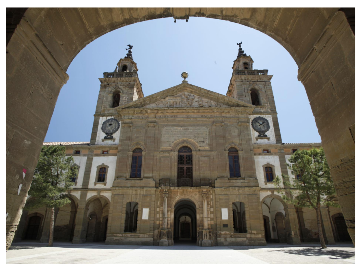
View of the University of Cervera's interior façade, with its remarkable tympanum, by Jaume Padró. Generalitat de Catalunya. Photo by Josep Giribet.

Building the university was the most transcendental event in the 19th century in Cervera, triggering the economic activity of the city. The erection decree was issued on 14 October 1717, although construction work did not start until 1718 and it was not finished until 1804. The two predominant generations of military engineers in Spain took part in the construction of the building, which led to its absolute symmetry. Jaume Padró, the sculptor from Manresa and author of the tympanum in the yard and of the altarpiece and dome in the Main Hall, worked on the last phase. While the majority of lecture rooms are found on the ground floor, the most representative spaces - the chapel and the Main Hall, with dual functions, both academic and religious - are on the first floor. This is the most privileged location in the building and it has the most symbolic and monumental significance. The library, which still preserves its remarkable roof truss and an outstanding door, is on the upper floor.