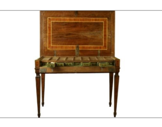
Vote counting table