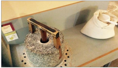
Scale of a Rotatory mill