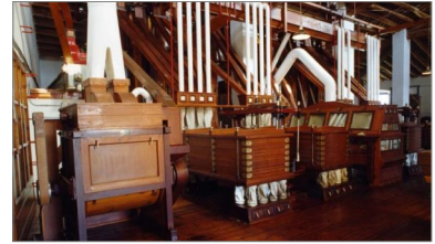
The production and the "rec del Molí" (channel)