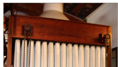
Collecting hoses, made by EMSA (Establecimientos Morros SA)