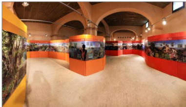
The "EmpordàNA'T" area. A unique natural space