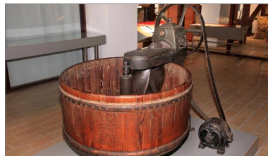
Kneading machine, "La Económica" model