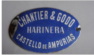
Plaque with the company name Chantier and Godó