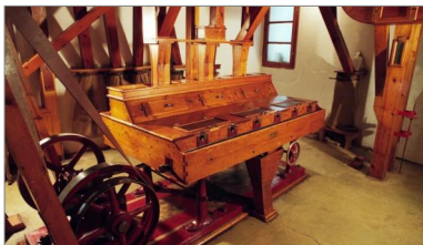
Stone cart made by Pérez y Muntané S. en C.