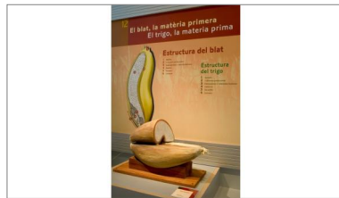
Scale of a wheat grain