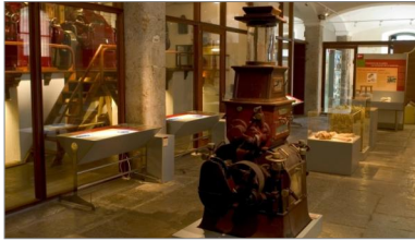
Revolution in grinding and all the force of water