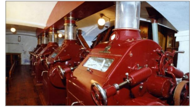
Brand mills made by EMSA (Establecimientos Morros SA)