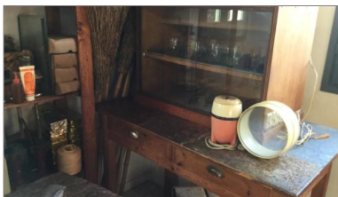
Pelshenke Index Cabinet