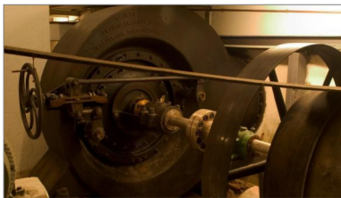
Francis turbine, made by Planes, Flaquer i Cia