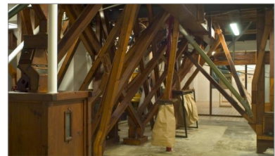
Belt bucket elevator