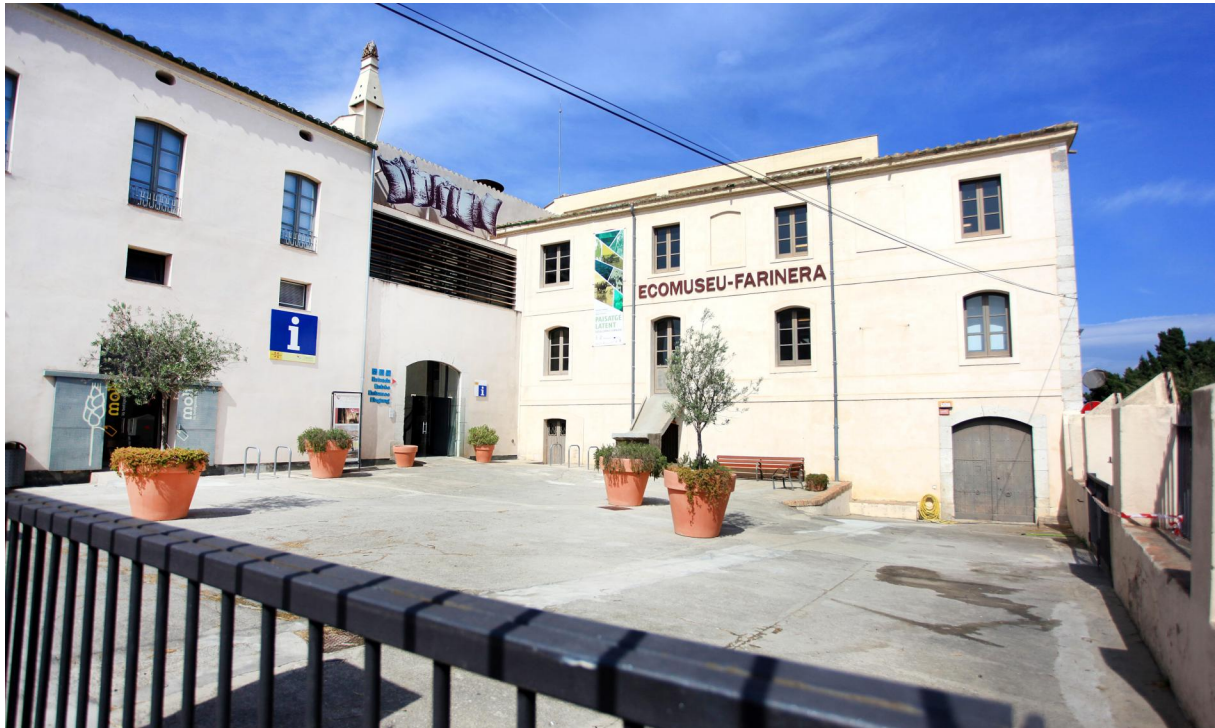
Welcome to the Flour Mill and Eco-Museum.

The Castelló d'Empúries Flour Mill and Eco-Museum is a factory that was open from the late 19th century and during the first half of the 20th century, built on the remains of three medieval flour mills. The Museum opened to the public in 1998, following a renovation carried out by the municipality. It was converted into an eco-museum with displays covering the flour industry in Catalonia and the great changes that took place in flour production during the second half of the 19th century. It is part of the network of Science and Technology Museums of Catalonia.