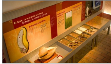
Do you know where flour comes from?