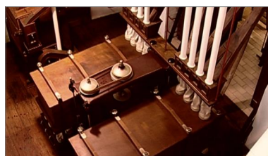
Plansichters made by EMSA (Establecimientos Morros SA)