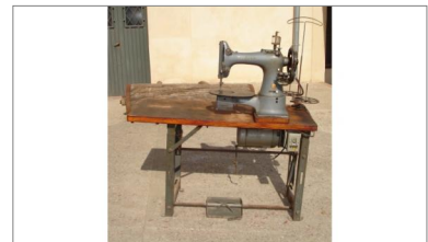
Sewing machine for bags with a Singer motor